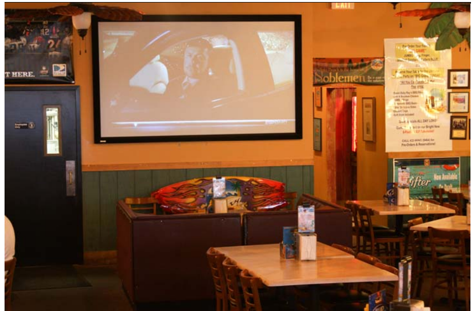
Buffalo Beach TV and SOME of the MANY Menu Items

Please check the AKC website for up dates and registration